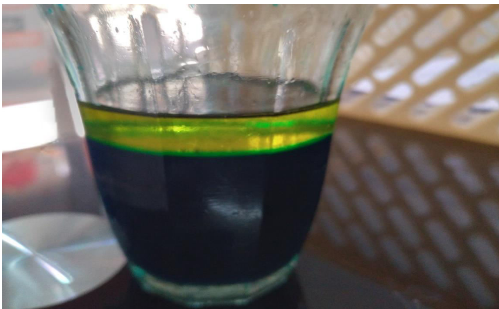
Fig01. The yellow Gel/Membrane (UF)