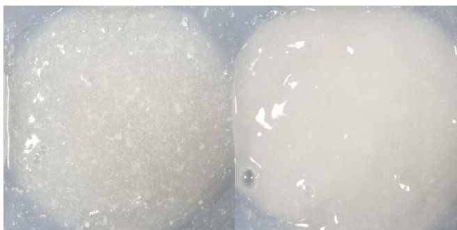
(Figure 2. Effect of bulking agent of powder phase to form Hydrogel. Left – mixed hydrogel without bulking agent, Right – mixed hydrogel with bulking agent)

In order to find out the endothermic effect of adding urea to the hydrogel, the temperature change was compared by measuring the temperature before and after mixing agents 1 and 2, which is the process of making the hydrogel. As shown in Figure 2, using a bulking agent, the second agent, made to facilitate dispersion and dissolution of urea, was added to the first agent and mixed to make a hydrogel. As a result, first agent, which was 22°C before mixing, decreased to 14°C after mixing, showing a drop of 8 degrees. (Table 2. A) In Table 1, the hydrogel exhibited an endothermic effect more than about 2.9 times when compared to the 2.8 degree drop when urea was 5.7%. Also, when only the gelling agent and urea were added, the drop was about 2.7 degrees (table 2 B), and when only the gelling and bulking agent were included, only a drop of 1.7 degrees was seen ( Table 2 C).